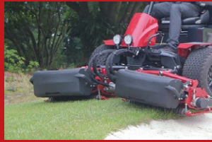
LED head light