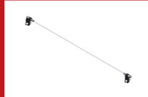
Rear roller brush